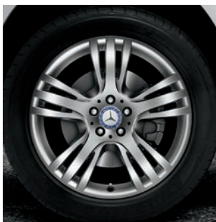
19" triple 5-spoke