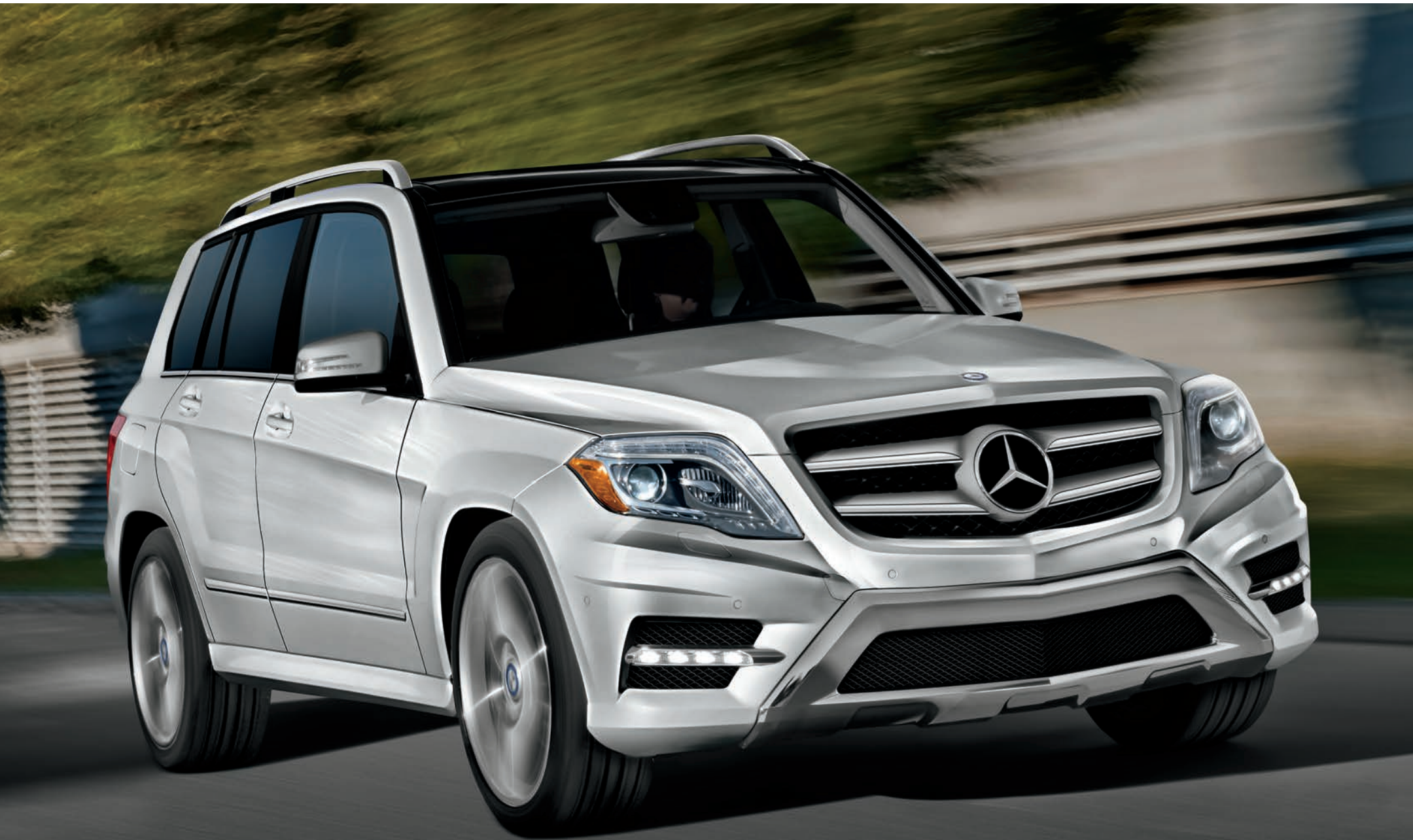
GLK350 shown with optional Iridium Silver metallic paint, PARKTRONIC, and AMG Styling, Lighting and Premium 1 Packages. Please see endnotes at back of brochure.