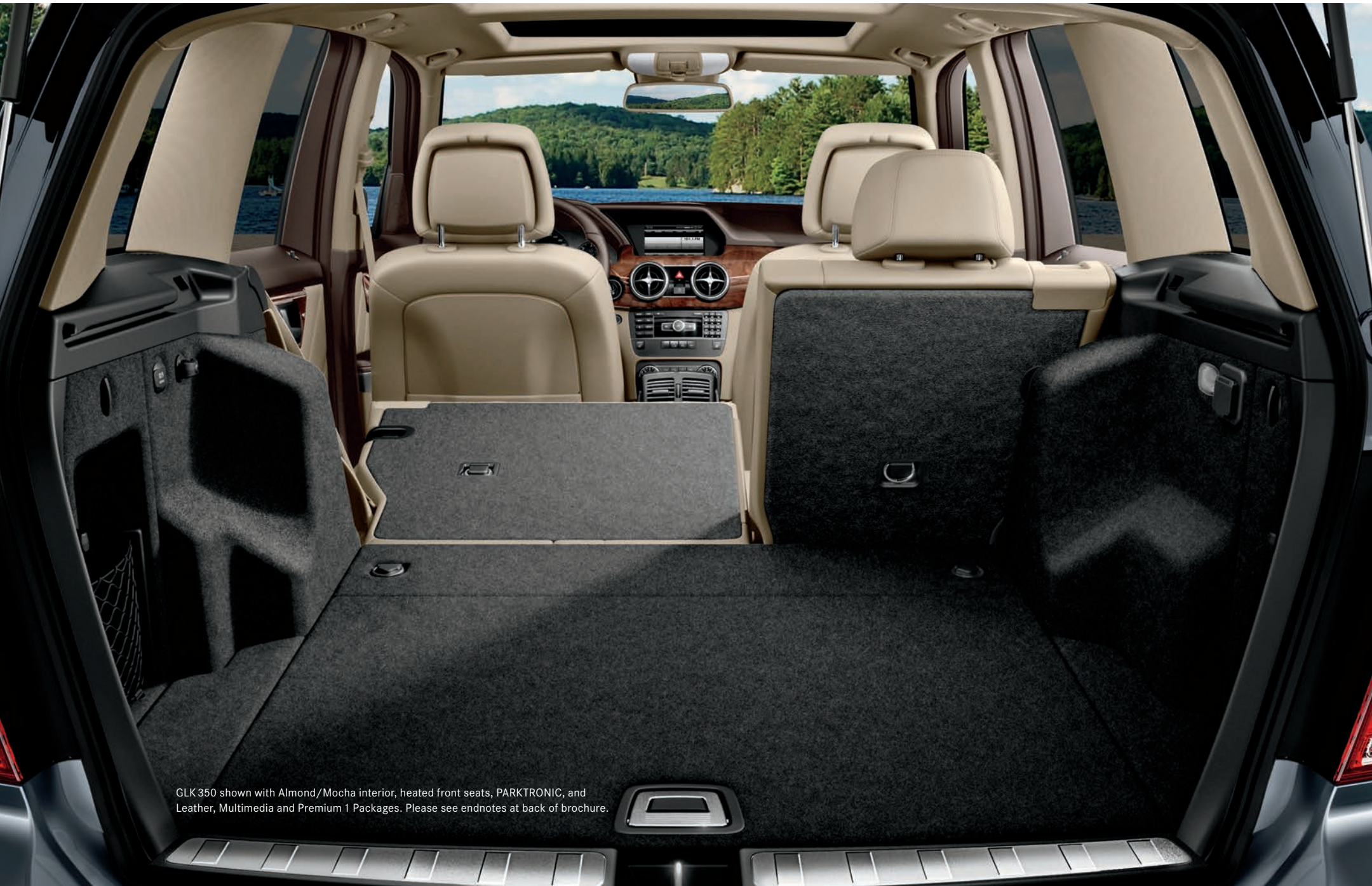
GLK 350 shown with Almond/Mocha interior, heated front seats, PARKTRONIC, and Leather, Multimedia and Premium 1 Packages. Please see endnotes at back of brochure.