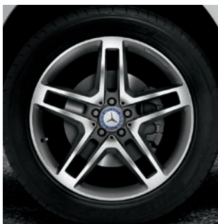
20" AMG twin 5-spoke (AMG Styling Package)