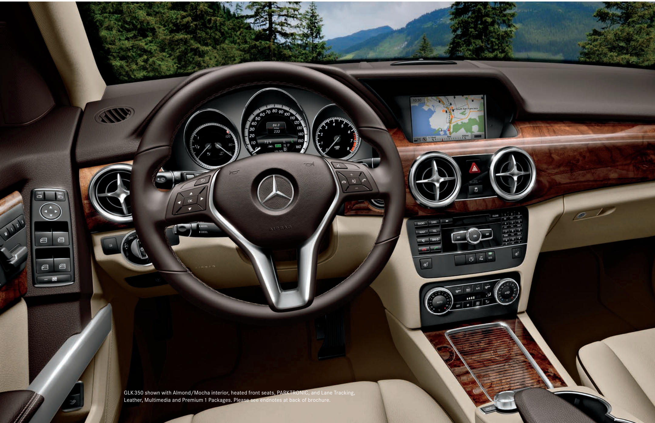
GLK 350 shown with Almond/Mocha interior, heated front seats, PARKTRONIC, and Lane Tracking, Leather, Multimedia and Premium 1 Packages. Please see endnotes at back of brochure.