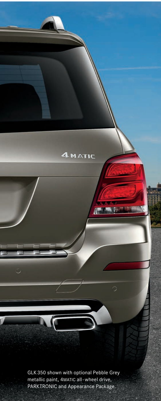
GLK350 shown with optional Pebble Grey metallic paint, 4MATIC all-wheel drive, PARKTRONIC and Appearance Package.