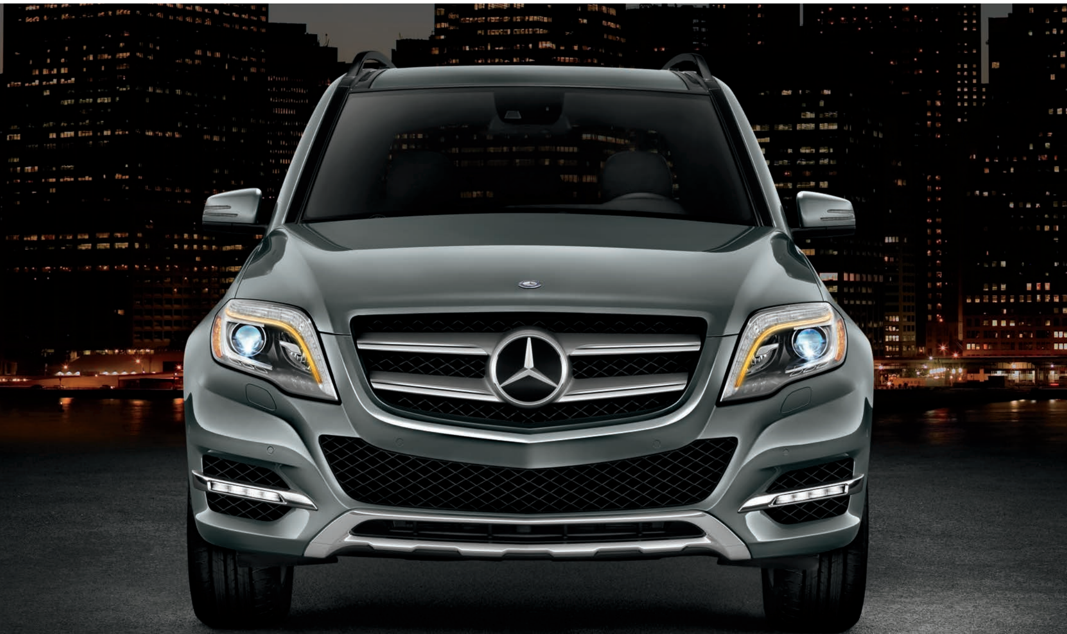
GLK350 shown above with optional Steel Grey metallic paint, PARKTRONIC and Lighting Package. GLK350 shown at left with Mocha interior and optional heated front seats, KEYLESS-GO, and Leather, Multimedia and Premium 1 Packages. Please see endnotes at back of brochure.