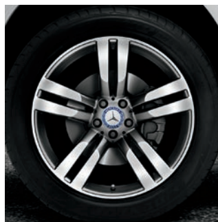
20" twin 5-spoke (Appearance Package)