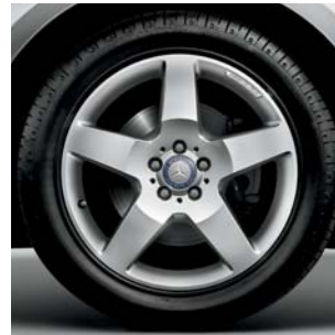
Standard 19" AMG 5-spoke (ML550 4MATIC)