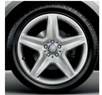
Optional 20" AMG 5-spoke (Dynamic Handling Package, ML 550 4MATIC)