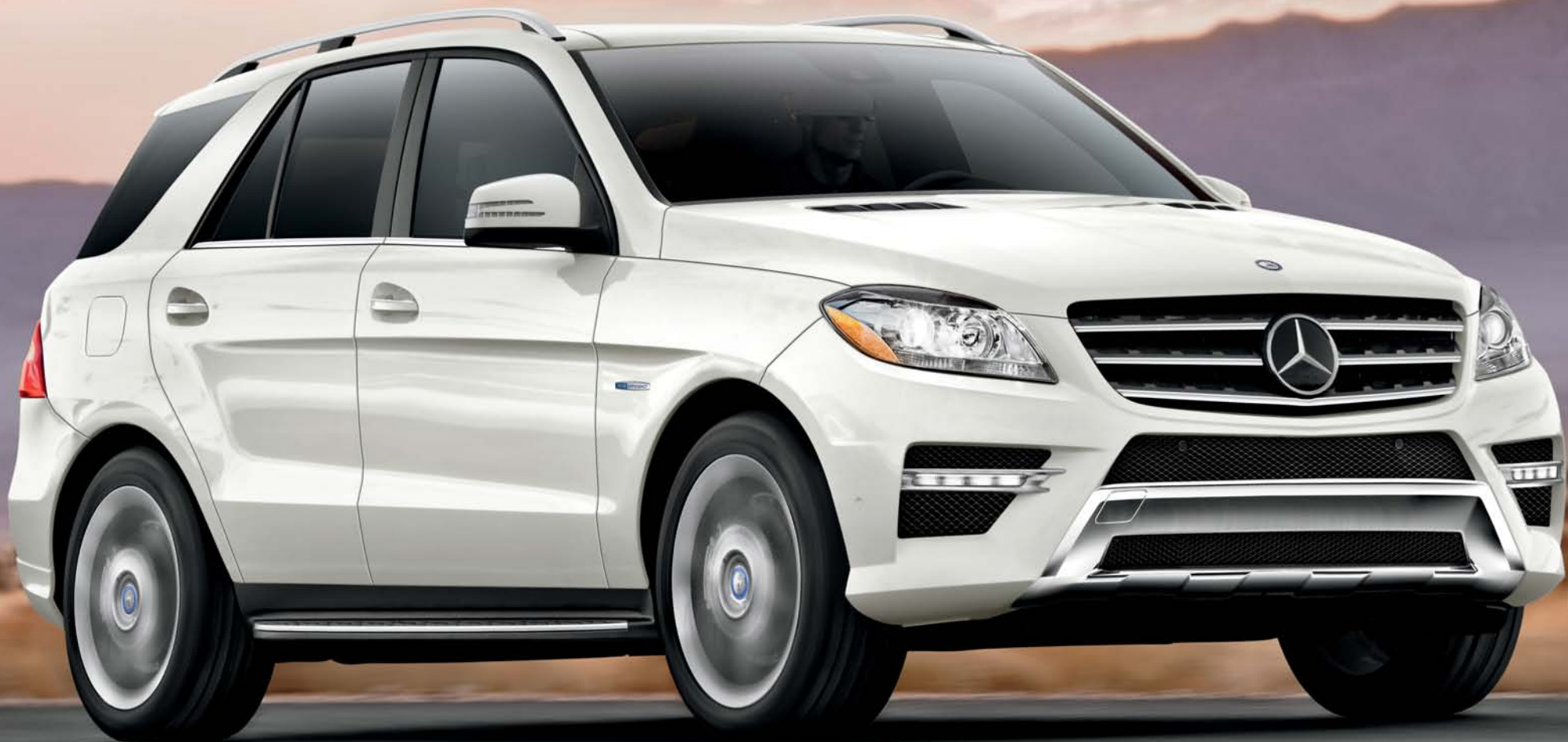
ML 550 4MATIC shown with optional Diamond White metallic paint, PARKTRONIC and Premium 2 Package. Please see endnotes at back of brochure.