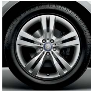
Standard 19" twin 5-spoke (ML 350 models)