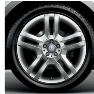
Optional 20" twin 5-spoke 4 (Dynamic Handling Package, ML 350 models)