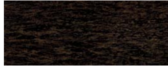
Eucalyptus (ML350 models)