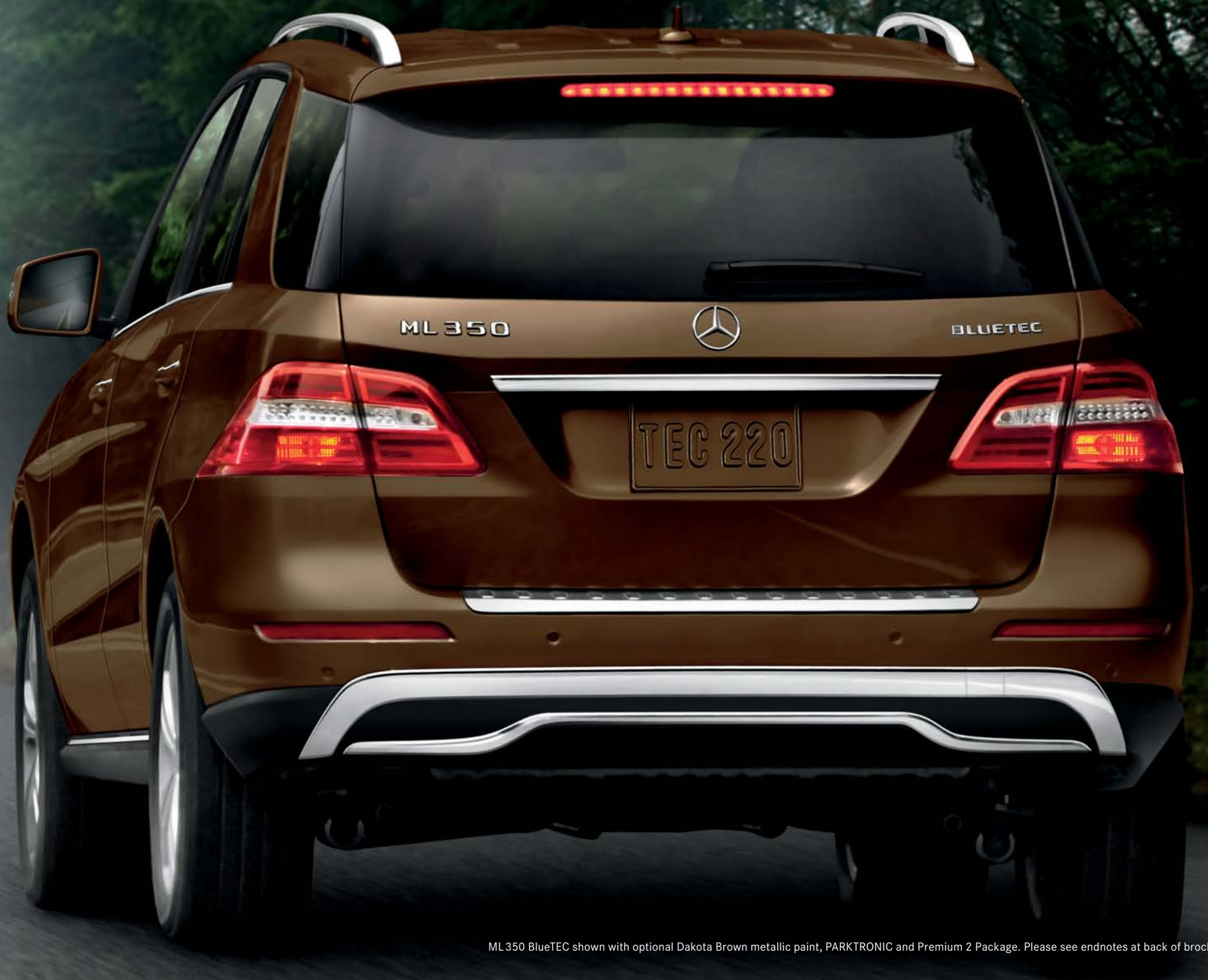
ML350 BlueTEC shown with optional Dakota Brown metallic paint, PARKTRONIC and Premium 2 Package. Please see endnotes at back of brochure.