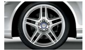
Optional 18" AMG twin 5-spoke (Sport Sedans)