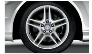
Standard 17" AMG twin 5-spoke (C 350 Sport)