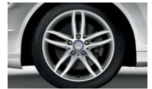
Standard 17" twin 5-spoke (C 250 and C 300 4MATIC Sport)