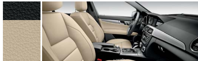
Sahara Beige/Black (Sport Sedans only, requires leather upholstery)