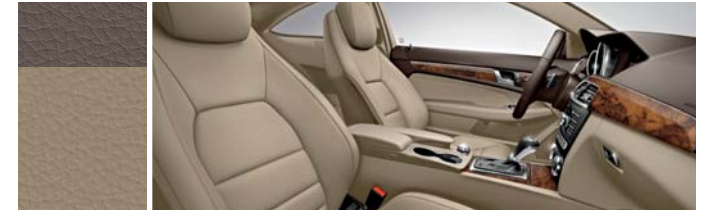
Almond Beige/Mocha (not available with leather upholstery)