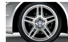
Optional 18" AMG twin 5-spoke