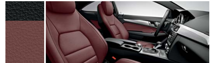
Red/Black (requires leather upholstery)