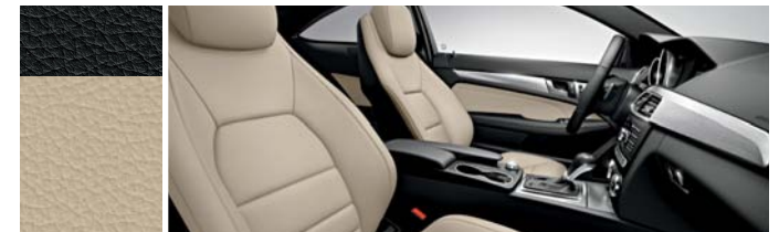
Sahara Beige/Black (requires leather upholstery)