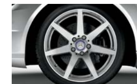
Optional 18" AMG 7-spoke