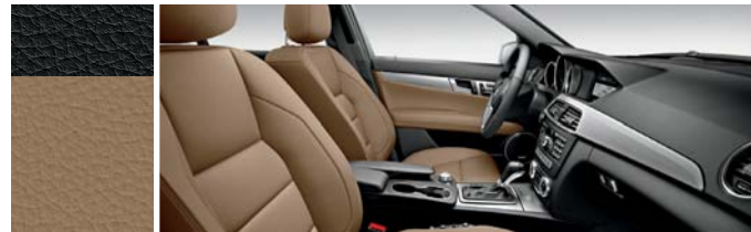
Cappuccino/Black (Sport Sedans only, requires leather upholstery)