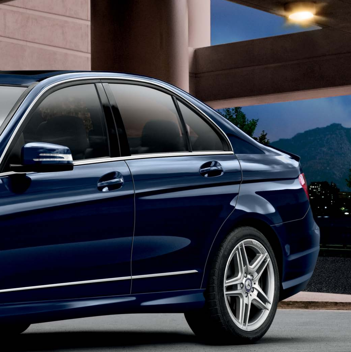
C350 Sport Sedan shown above with optional Lunar Blue metallic paint, 18" AMG twin 5-spoke wheels, and Lighting and Premium 1 Packages. C300 4MATIC Luxury Sedan shown at right with Black paint and optional Lighting Package. Please see endnotes at back of brochure.