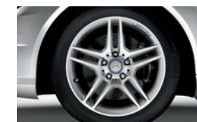
Standard 17" AMG twin 5-spoke (C 350)