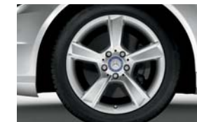
Standard 17" 5-spoke (C 250)