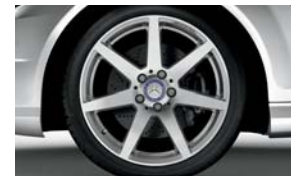
Optional 18" AMG 7-spoke (Sport Sedans)