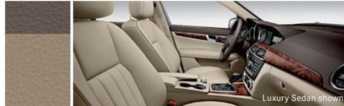
Almond Beige/Mocha (not available with leather upholstery on Sport Sedans)