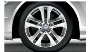
Standard 17" split 5-spoke (C 250 and C 300 4MATIC Luxury)