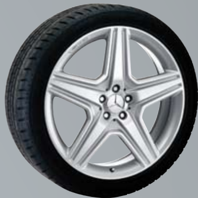
AMG 5-spoke wheel | Style III

AMG light-alloy wheel | Finish: silver, high-sheen