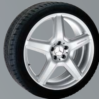
AMG 5-spoke wheel | Style III

Wheel: 10 J x 20 ET 46 | Tire: 295/40 R20