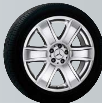
Alrai | 6-spoke wheel

Wheel: 8 J x 19 ET 60 | Tire: 255/50 R19 B6 647 4217