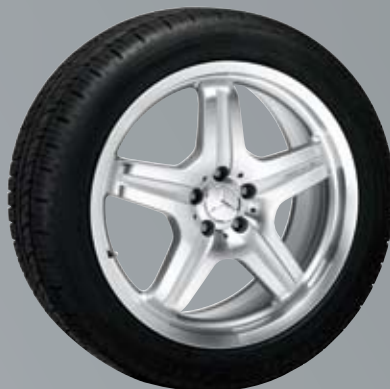
AMG 5-spoke wheel | Style VI

Wheel: 9 J x 21 ET 60 | Tire: 265/40 R21