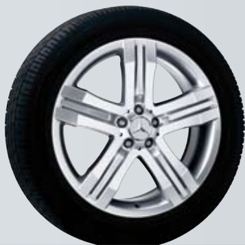
Furud | 5-spoke wheel

Wheel: 8 J x 19 ET 60 | Tire: 255/50 R19 B6 647 4300