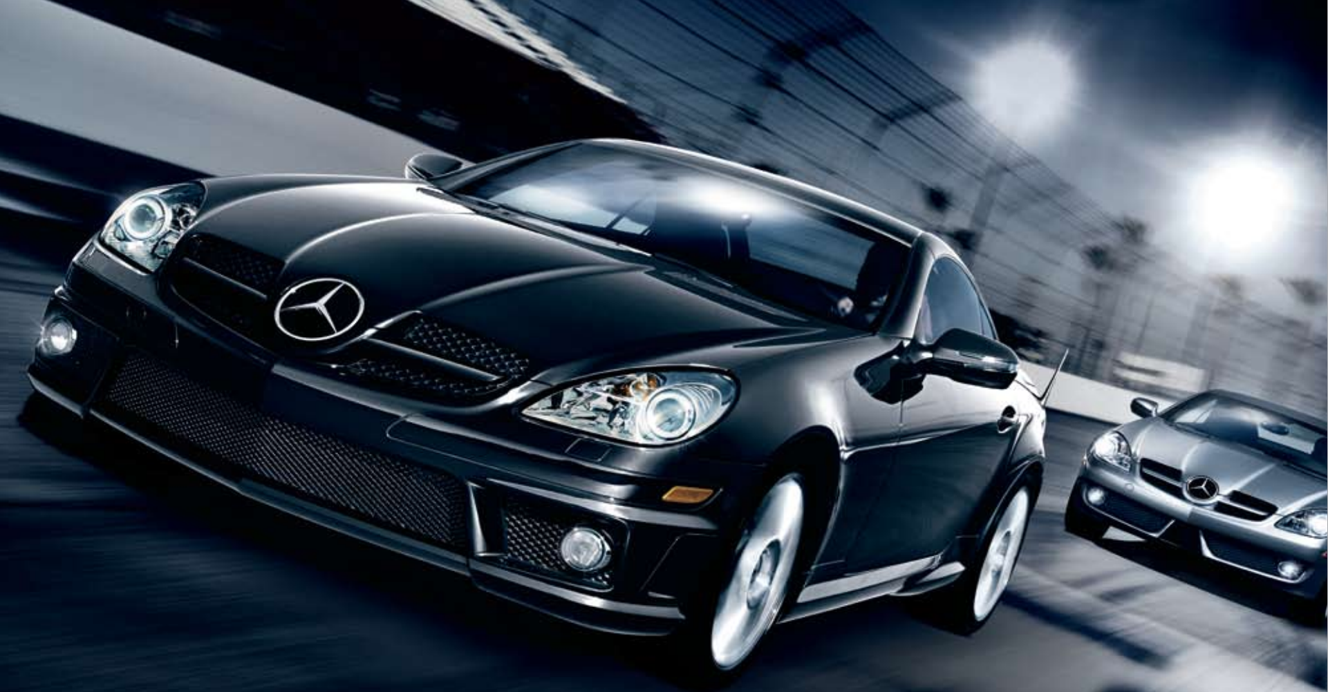
SLK300 shown above left with optional Obsidian Black metallic paint and Sport and Lighting Packages. SLK350 shown at right with optional Iridium Silver metallic paint. Please see endnotes in back of brochure.

SLK-Class features, options and packages. Every SLK comes equipped with features and systems to enhance every drive with performance, comfort and security – from its automatic light-sensing headlamps to its LED taillamps. Refinements also include leather upholstery, dual-zone climate control, a multifunction display, and a Tire Pressure Monitoring System that shows the inflation pressure of all four mounted tires. To tailor your SLK even more precisely to your wishes, a wide array of innovations and enhancements are offered as individual options, or packaged together at a significant savings.