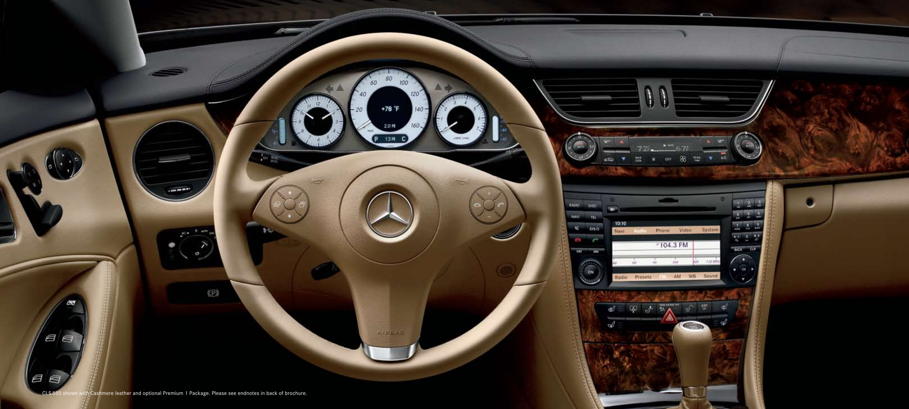
CLS 550 shown with Cashmere leather and optional Premium 1 Package. Please see endnotes in back of brochure.

The 2010 CLS-Class. Intimately engaging yet extensively attentive accommodations welcome you into the CLS-Class. Four individually contoured seats are hand-fitted in fine leather, and divided by a full console that sweeps from front to rear in a flourish of polished High-gloss Laurel wood and elegant top-stitching. High technology is present in equal abundance: Digital sound surrounds you. Navigation responds to your voice. Even traffic conditions are delivered via satellite to smooth your journey. And crisp, white instruments are ringed in chrome and set amid the largest single span of wood used in a modern Mercedes-Benz – a tribute to timeless craftsmanship in a refreshingly modern environment.