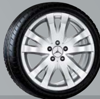
Sadalbari | 5-twin-spoke wheel