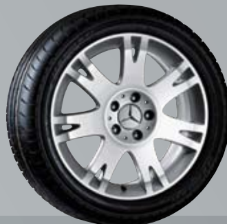
Zurak | 7-spoke wheel

Option in titanium silver also available