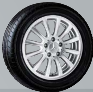
Kochab | 12-spoke wheel

Light-alloy wheels are supplied without tires, wheel bolts or hub caps.