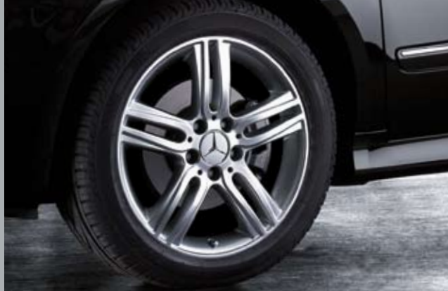
Bokhan | 5-twin-spoke wheel

Judge for yourself which of the incenio designer wheels shown on this page would result in the most breathtaking look for your own B-Class.