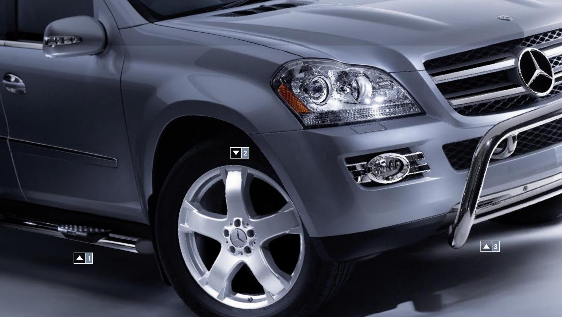
1 ▶ Tubular Steel Side Step Bars [P. 9] | 2 ▶ Porrima 20" 5-Spoke Wheel [P. 10] | 3 ▶ Tubular Steel Grille Guard [P. 8]