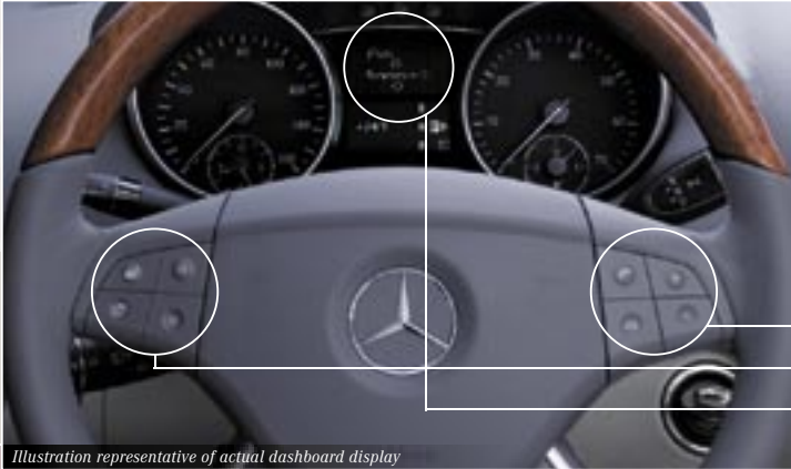
Illustration representative of actual dashboard display