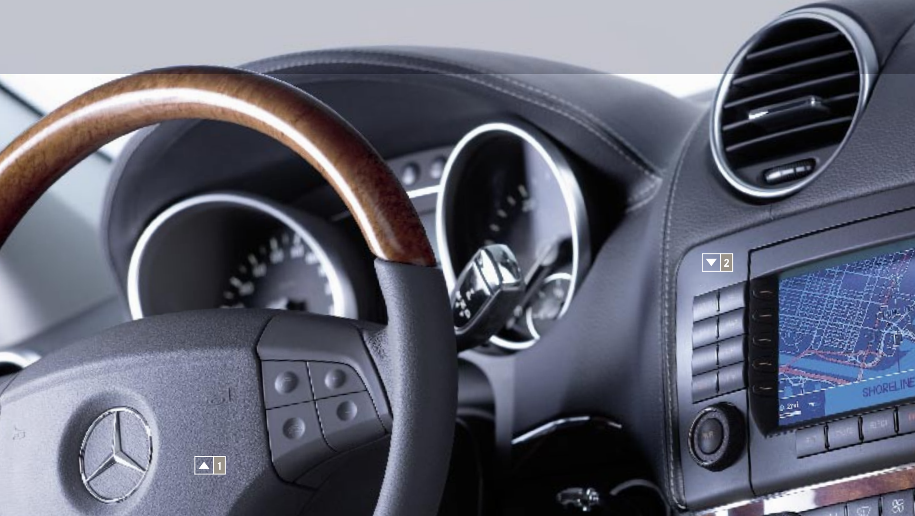
1 ▶ Wood & Leather Steering Wheel [see chapter APPEARANCE P. 12] | 2 ▶ Navigation System [P. 17] | 3 ▶ iPod® Integration [P. 21]