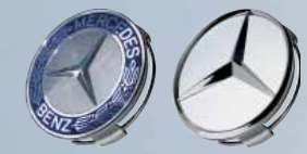
Hub cap Protects the hub from dirt; available as a chrome star and in the classic design in blue