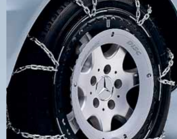
Rudmatic-Disc snow chain system Provides a secure grip in snow. A plastic ring prevents your wheel from being scratched.