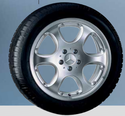
Difda | 5-hole wheel incenio designer wheel Wheel size 8 J x 18 ET 44 Tyres 245/45 R18