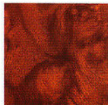
Burl walnut (E 320 and E 430)