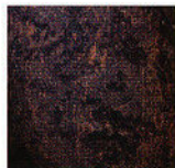
Black birdseye maple (E55 AMG)