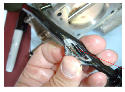
Plastic filler cords

Cut a slit ~2-3" long in the sheathing covering the wires. Open the slit to inspect the insulation on the wires. If there is any evidence of cracking or flaking, you will need to rewire the unit.